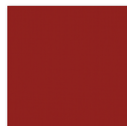
6035-0222 Romantica roșu/red | lucios/glossy PEI 3