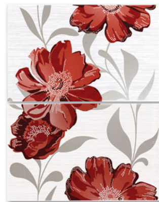
2642-0441 roșu/red | lucios/glossy