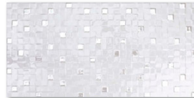
2651-0108 alb/white | lucios/glossy