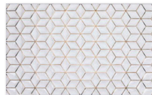
2642-0489 alb/white | lucios/glossy