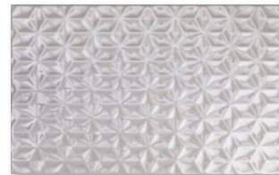
2042-0570 gri/gray | lucios/glossy