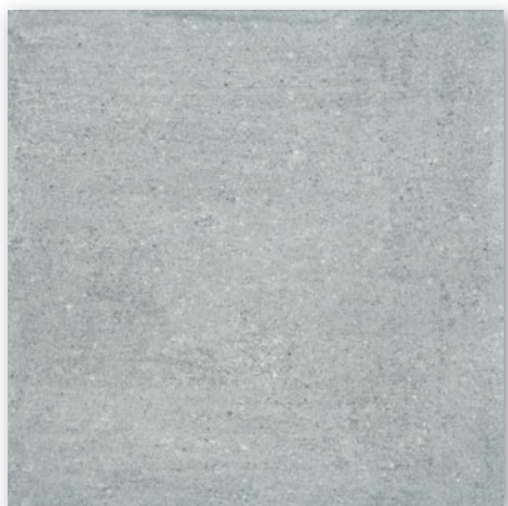
6461-0156 / DAK63661 PEI 5 mat | matt gri / gray