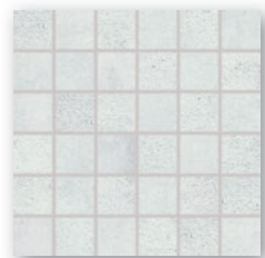
6100-0110 / DDM06660 (SET) PEI 5 mat | matt gri deschis / light gray