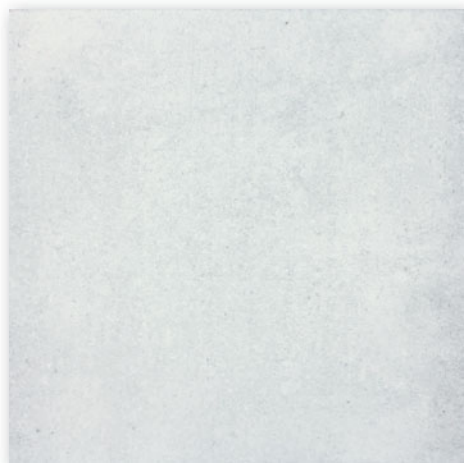
6461-0165 / DAK63660 PEI 5 mat | matt gri deschis / light gray