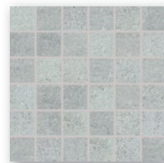
6100-0052 / DDM06661 (SET) PEI 5 mat | matt gri / gray