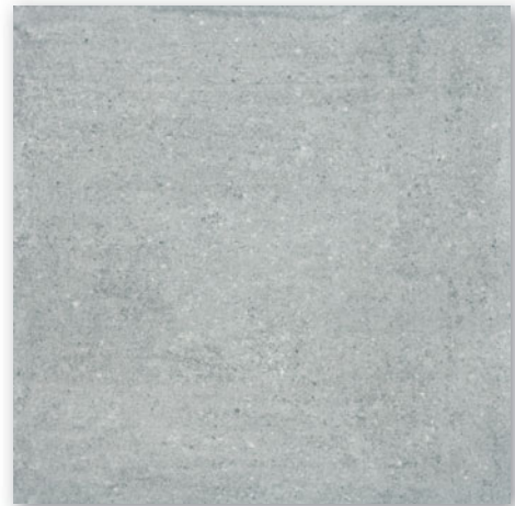
6461-0156 / DAK63661 PEI 5 mat | matt gri / gray