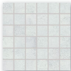
6100-0110 / DDM06660 (SET) PEI 5 mat | matt gri deschis / light gray