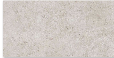
2060-0138 ivoriu/ivory | mat/matt