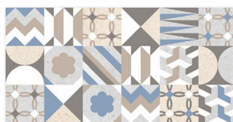
2060-0139 multicolor/multicolour | mat/matt