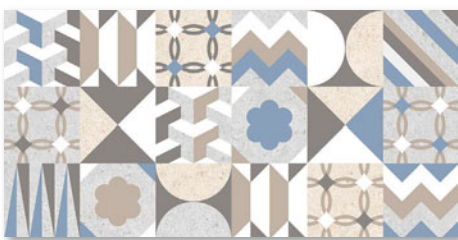
2060-0137 gri deschis/light gray | mat/matt