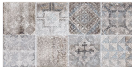
1260-0083 gri/gray | mat/matt