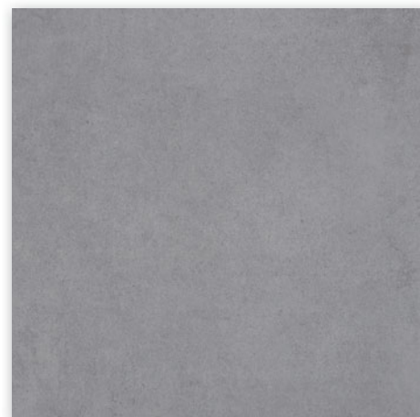
6061-0029 Tempo gri închis/dark gray | mat/matt PEI 4